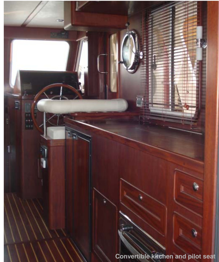
Convertible kitchen and pilot seat

Bank: TKB Thurgauer Kantonalbank, 8280 Kreuzlingen Classic Yacht and Trawler AG (in Gründung), Konto Nr 2576.9204.2001, IBAN CH10 0078 4257 6920 42001, SWIFT KBTGCH22