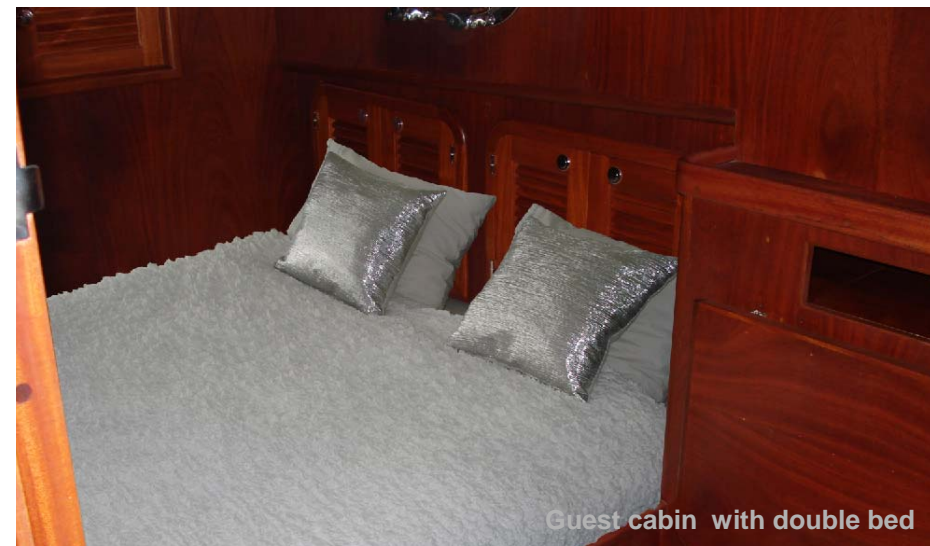
Guest cabin with double bed

Bank: TKB Thurgauer Kantonalbank, 8280 Kreuzlingen Classic Yacht and Trawler AG (in Gründung), Konto Nr 2576.9204.2001, IBAN CH10 0078 4257 6920 42001, SWIFT KBTGCH22