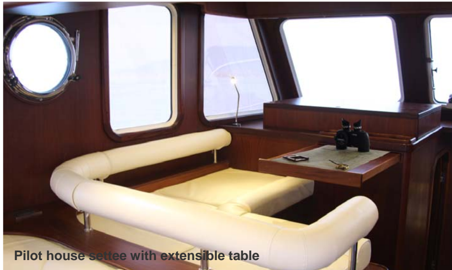
Pilot house settee with extensible table