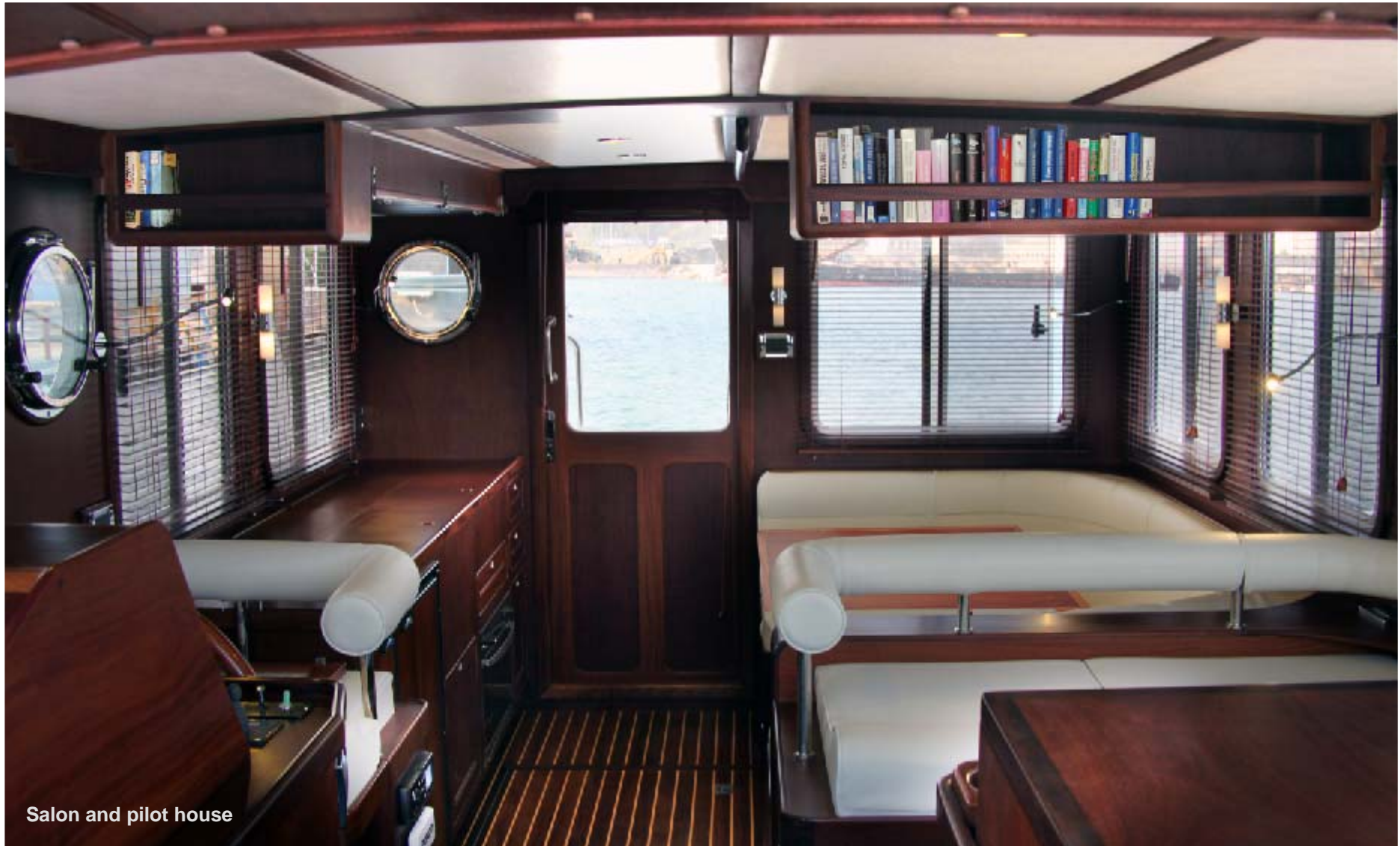
Salon and pilot house