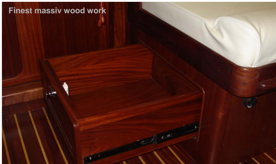
Finest massiv wood work