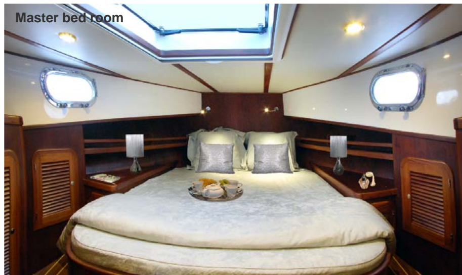
Master bed room