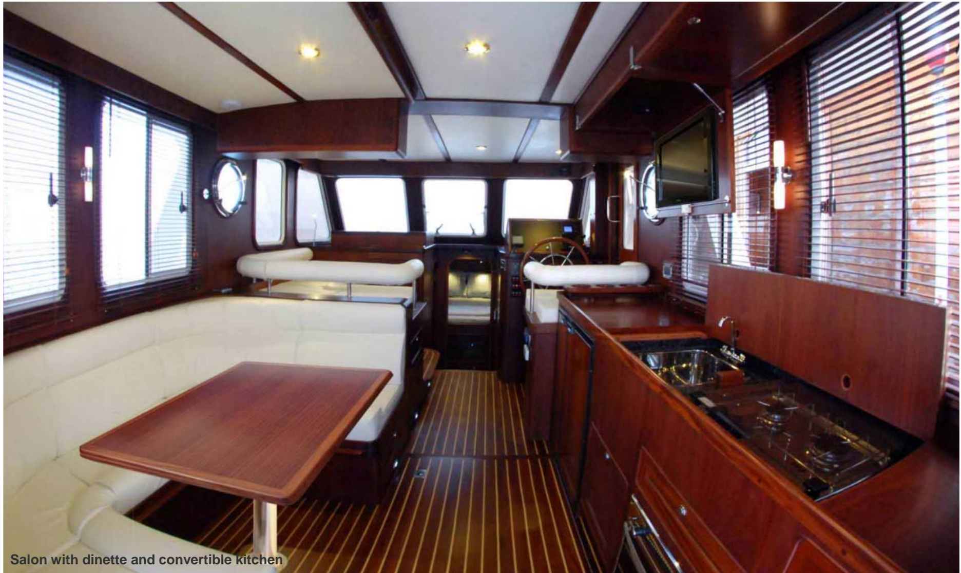
Salon with dinette and convertible kitchen

Bank: TKB Thurgauer Kantonalbank, 8280 Kreuzlingen Classic Yacht and Trawler AG (in Gründung), Konto Nr 2576.9204.2001, IBAN CH10 0078 4257 6920 42001, SWIFT KBTGCH22