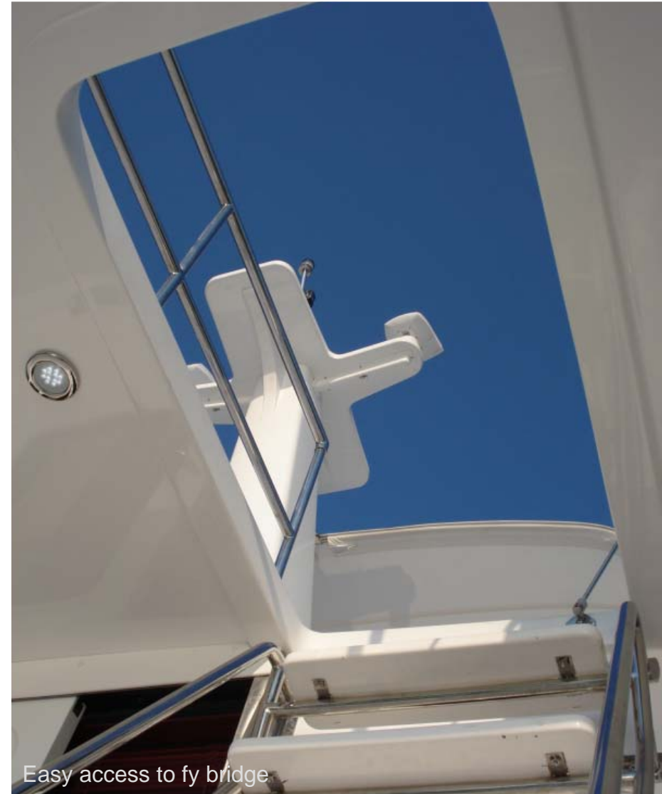
Easy access to fly bridge

Bank: TKB Thurgauer Kantonalbank, 8280 Kreuzlingen Classic Yacht and Trawler AG (in Gründung), Konto Nr 2576.9204.2001, IBAN CH10 0078 4257 6920 42001, SWIFT KBTGCH22