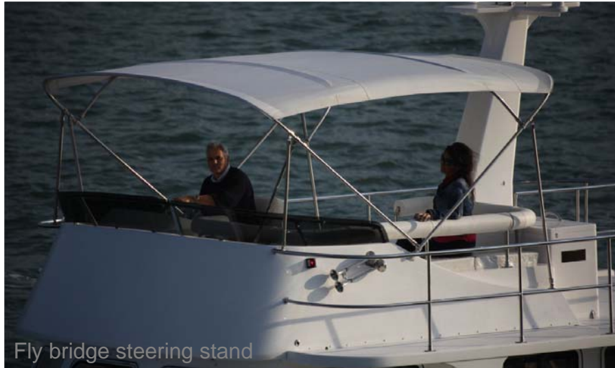
Fly bridge steering stand