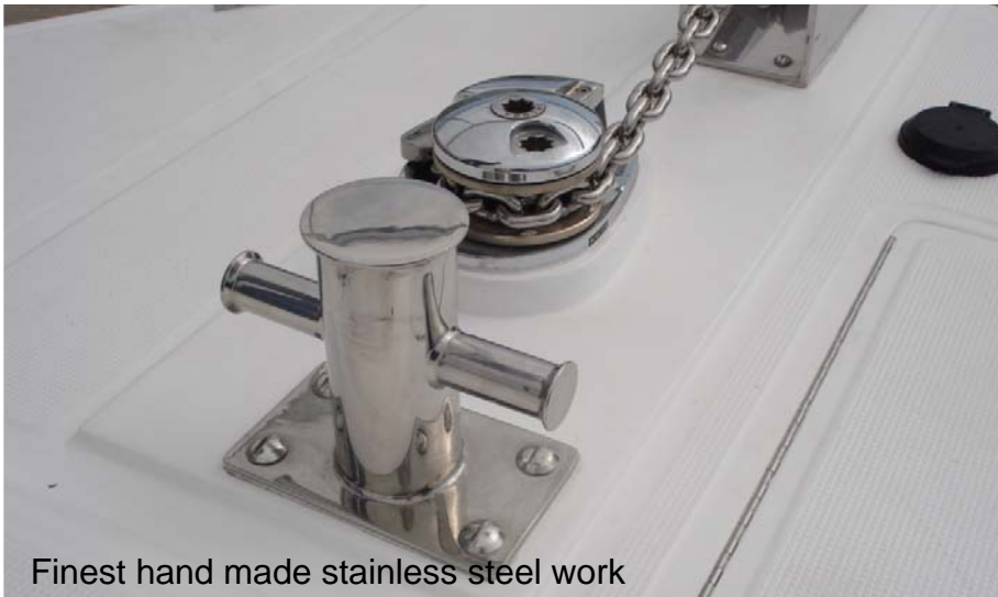
Finest hand made stainless steel work