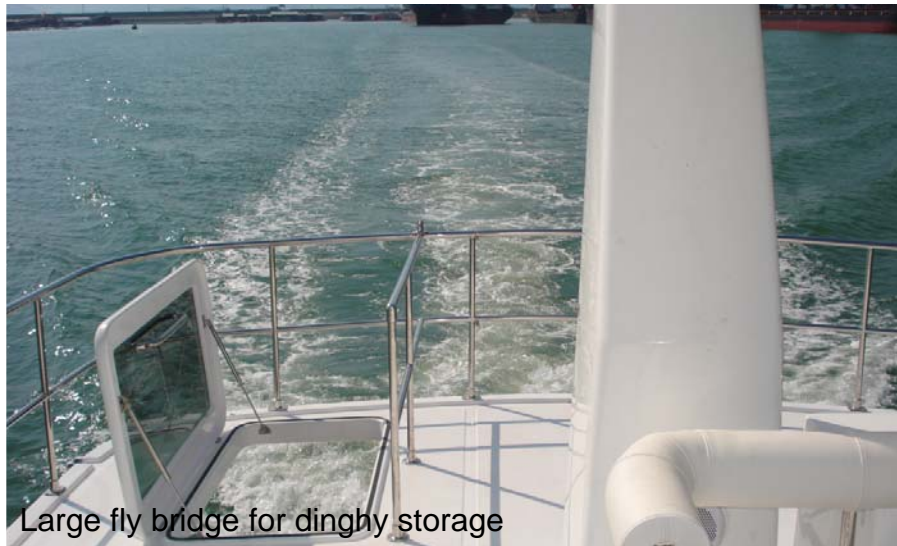
Large fly bridge for dinghy storage