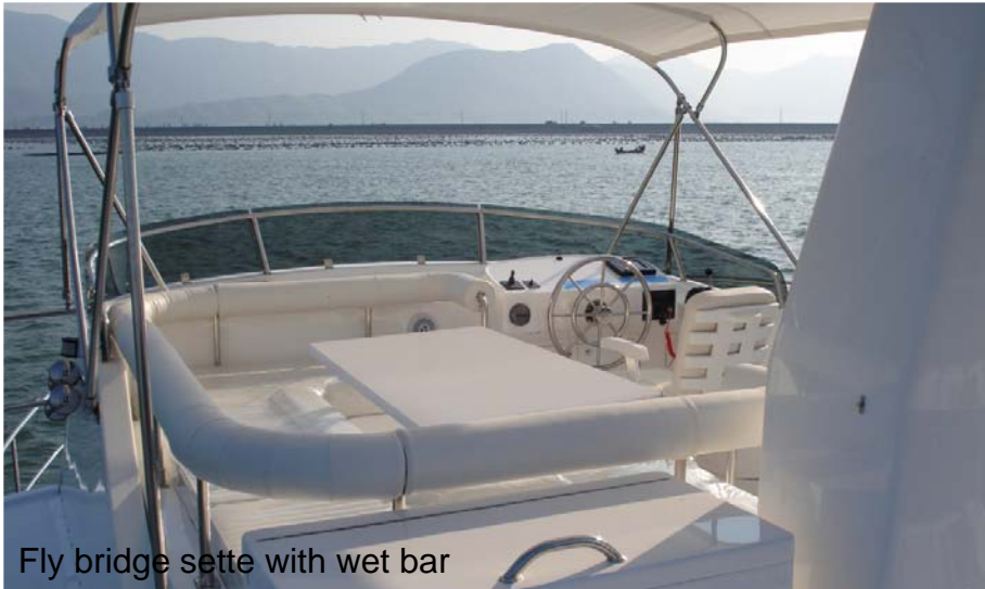
Fly bridge settee with wet bar